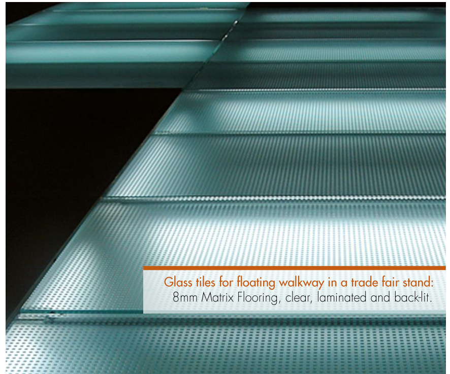
Glass tiles for floating walkway in a trade fair stand: 8mm Matrix Flooring, clear, laminated and backlit.

***** Main Laboratory Sassuolo/Italy: test report no. 0038/2019.